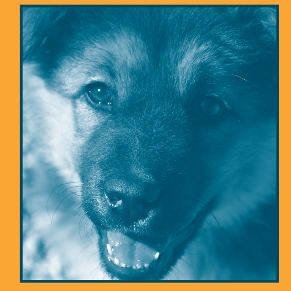
Table Mountain Animal Center Foundation is a not-for-profit (5013) organization. Part of your entry fee may be deductible as a business or personal expense.

Non-golfers are welcome to support the "cause" and enjoy cash-bar cocktails, dinner and the silent auction ($25 per guest)